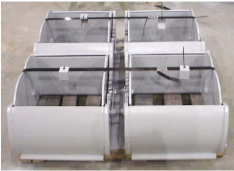
DOUBLE GATE BIN GATES