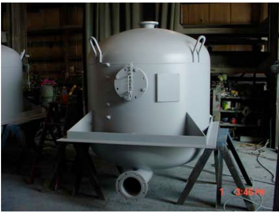
STEEL TANKS ALL SHAPES AND SIZES