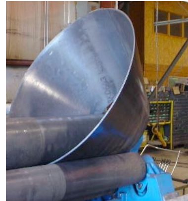
PLATE AND TUBULAR ROLLING