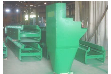
CUSTOM BUILT SPECIALTY CONVEYORS