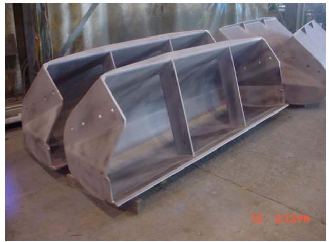
ALL TYPES AND SIZES OF BUCKETS