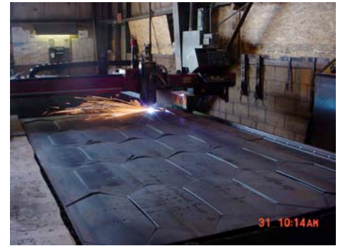
CNC PLASMA MACHINE